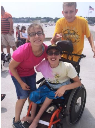
Fun at the beach ☺