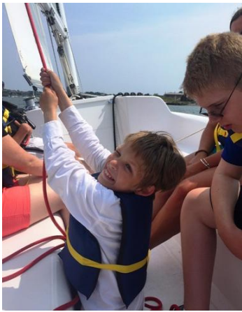
Sailing in Newport Harbor

"You can do anything you set your mind to!"