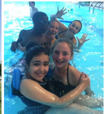
Cool in the pool