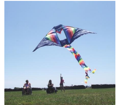
Soaring kites & high spirits

The cost for a whole week of "Confidence is Cool" camp is only $150. Scholarships and partial scholarships are available - no one has ever been turned away due to lack of finances.