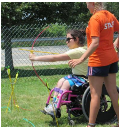
Archery aiming for a bulls eye